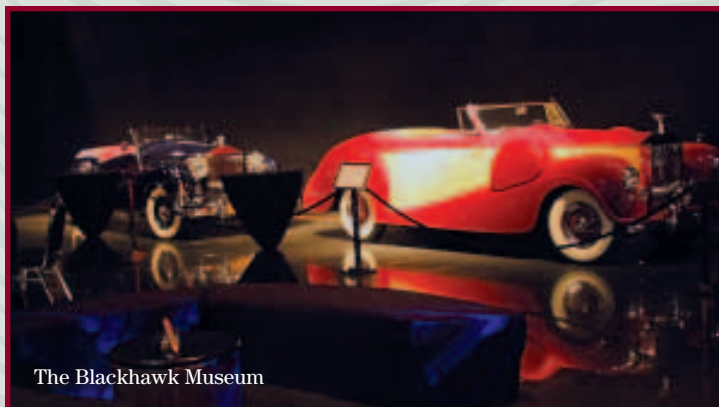
The Blackhawk Museum

For groups of 25 to 1,000 THE BLACKHAWK MUSEUM is the perfect place for your next event! Our exclusive event hospitality staff can handle the menus, flowers, lighting, sound and every detail of your event.