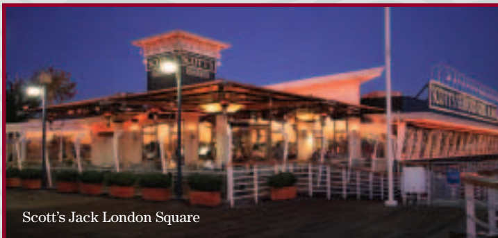
Scott's Jack London Square