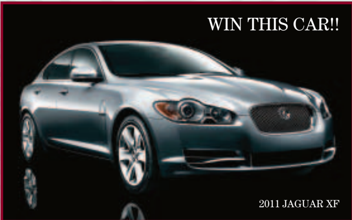
2011 JAGUAR XF