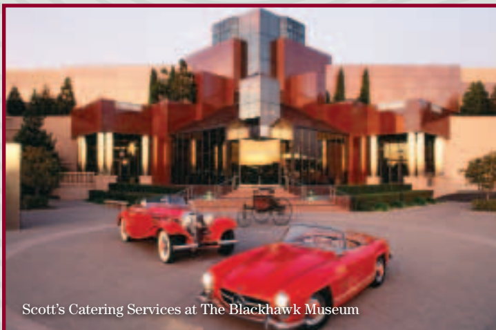
Scott's Catering Services at The Blackhawk Museum