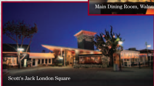
Scott's Jack London Square