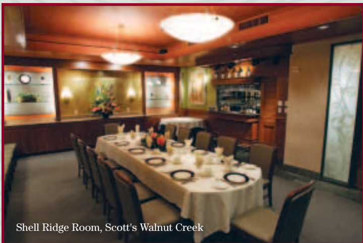
Shell Ridge Room, Scott's Walnut Creek