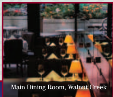
Main Dining Room, Walnut Creek