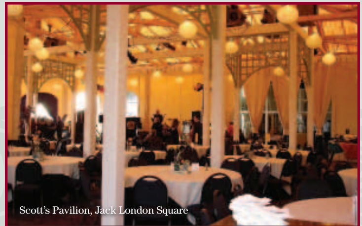
Scott's Pavilion, Jack London Square

The ultimate in privacy, expansive views, full bar facilities, and tasteful appointments, Scott's Catering Services provides every detail necessary for your special event. Please call to arrange for a complimentary roundtable luncheon and a tour of our facilities or visit us at our website at www.scottseastbay.com .